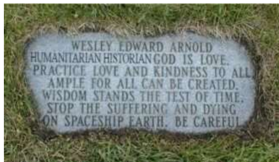
Stone at Forest Lawn