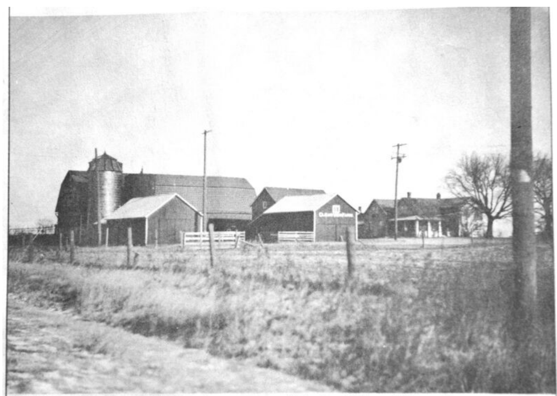
The Halmich Farm on the northeast corner of Twelve Mile and Mound, present site of General Motors Technical Center.