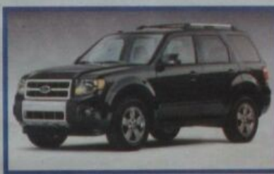
The Ford Escape Hybrid Limited offers a hushed ride and spectacular fuel economy.