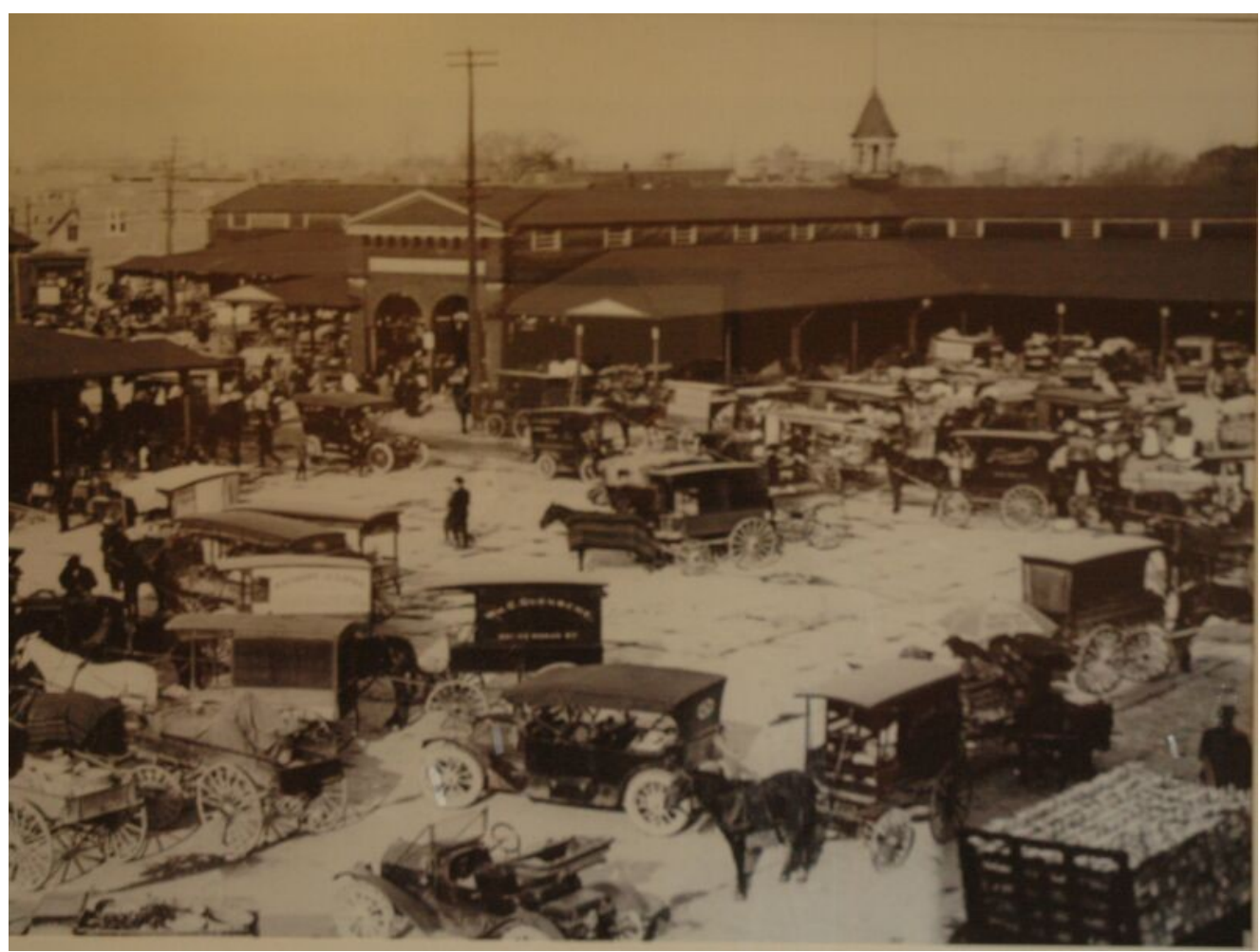
Farmers took their extra produce to the Detroit Eastern Market to earn money.