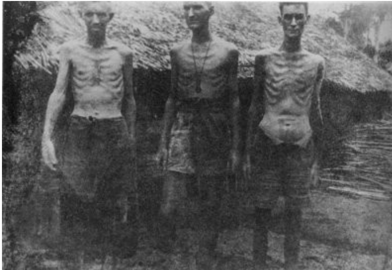
Slow starvation and work to death our POWs