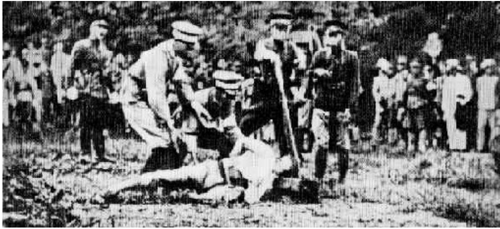
Scalp and public torture of POW cutting off body parts