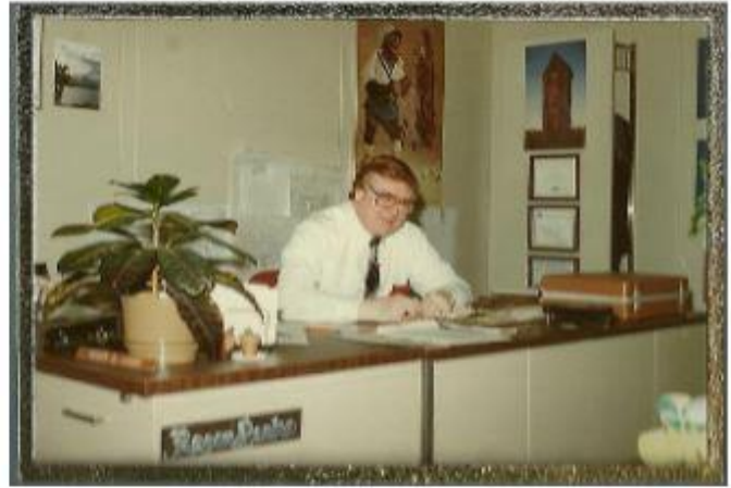
Engineering Group Manager, 1982 Fisher Bodv. GM