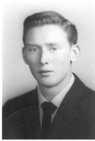
High School, 1958 De La Salle Collegiate